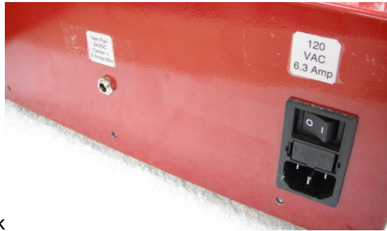
Vent fan jack

Unpack the machine. It is recommended that the packing materials be saved for future transport of the machine. Place the Matador on a level, smooth surface. Plug the supplied cord into the back of the machine, and then into a grounded 20 amp wall receptacle. The required voltage is listed on the rear of the machine. Fill the cups to within 1/4 inch (6 mm) of the top